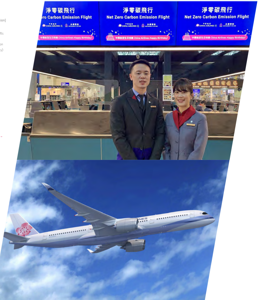
Net Zero Carbon Flights

CAL celebrated its 63rd anniversary (December 16, 2022) with “Net Zero Carbon Flights”. The “ECO Travel” carbon offsetting platform developed by CAL in collaboration with Climate Impact Partner, a British professional environmental protection organization, provided “Net Zero Carbon Flights” for all passenger and cargo flights departing from Taiwan by offsetting 7,000 tons of carbon emissions. CAL has partnered with professional environmental protection organizations to support the development of renewable energy projects and promote global energy transformation by selecting high-quality carbon credits with the international certification. We also hope that the large-scale “carbon neutrality” initiative, the first-ever of its kind in Taiwan transportation industry, can help us attain ESG sustainability and we invite passengers to support low-carbon travel by taking the first major step. We encourage passengers to take public transportation to the airport, use the Internet to check-in, pre-select meals, and bring their own duty-free eco-bags to support carbon reduction and reduce the burden on the Earth.